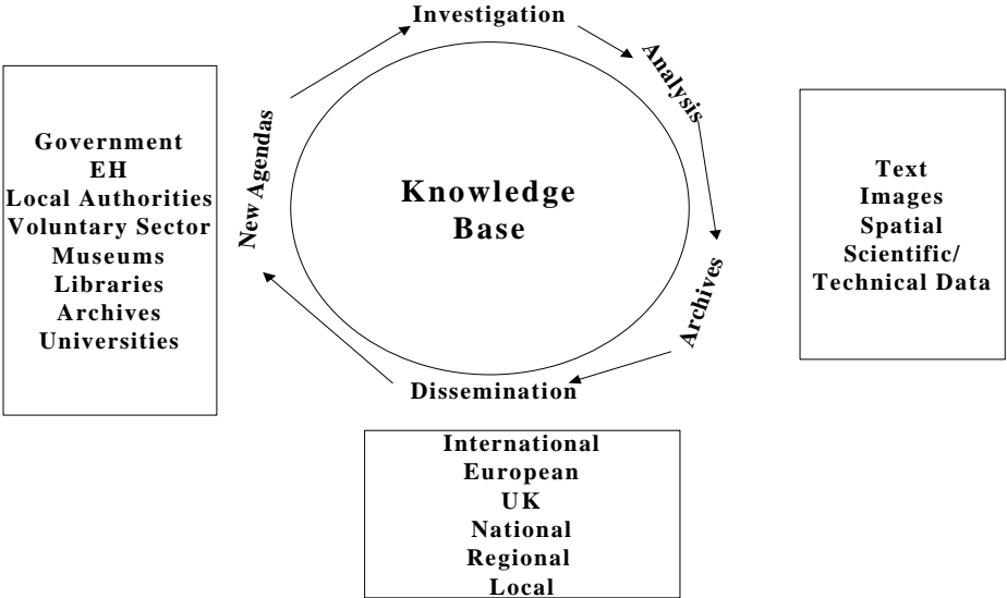
Fig 1 – The knowledge Base

also a hierarchy of levels, from the local, through the regional, national, UK and European to the international. The material is varied, including text, images, spatial and scientific/technical data. Much of it is now captured electronically, for example, as word-processed files, digital imagery, or through electronic distance measuring and global positioning techniques.