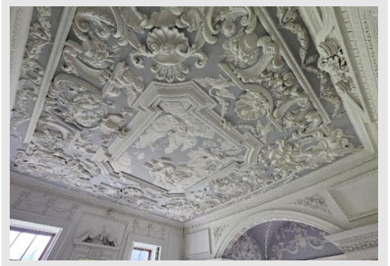
Fine plaster ceiling

Many thanks to Debbie Gardner for setting up this amazing CPD opportunity. We were lucky enough to be treated to a stunning