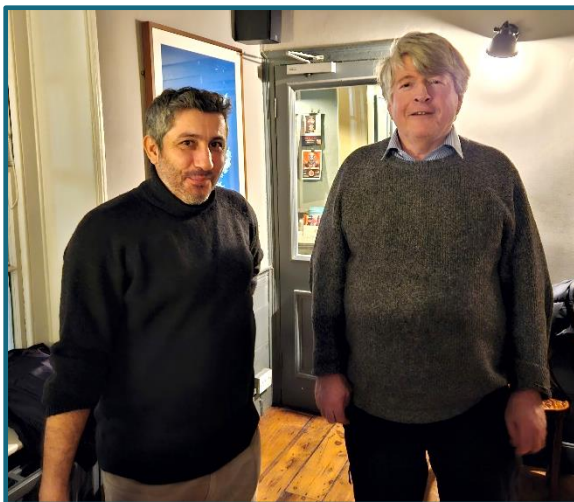
IHBC Christmas Bash at The George in Turnbridge Wells

One point to note, chatting to fellow members, it is clear that Local Authorities are outsourcing Conservation officer posts, as it is hard to find and keep permanent staff when you don't support them properly it seems!