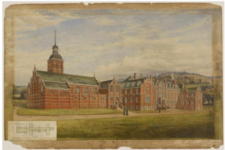
French Renaissance – Dutch Jacobean 1891