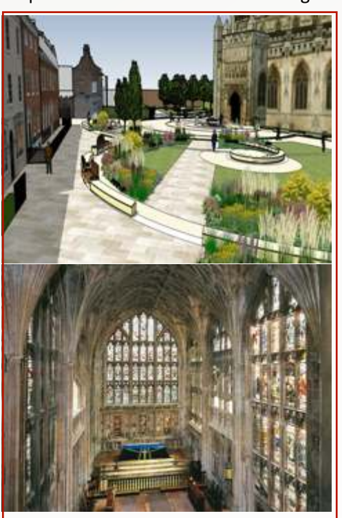
Project Pilgrim showing an artist's impression of part of the new public space and grounds in the south precinct (top) and a high-level view taken inside the Lady Chapel

Publication of Bulletin 31 has been delayed for a number of reasons, including a spell in hospital and resultant work backlog. After four years and 11 Bulletins , it is now time for me to step down as editor and hand over the reins to someone new. Enquiries welcome and some training on Serif PagePlus available. Malcolm James