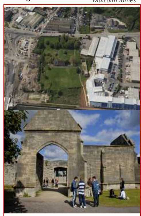
Aerial view of Llanthony Secunda Priory looking west with the new Gloucestershire College campus at right (top) and the tithe barn entrance through to the College