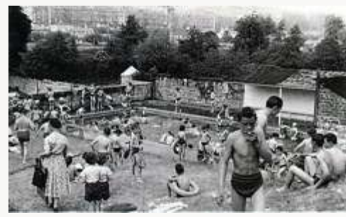
Children's Pool in 1960

The crescent includes a central, two-storey cottage that housed the caretaker, unfortunately much altered internally although there are some surviving architectural features. The cottage is flanked either side by changing cubicles. To the west of the crescent was where the 'Ladies' Pool' was located. Whilst the building still survives it is in a much altered state and the pool itself was filled with concrete at some point in the latter part of the 20th century. To the east a separate pool was built in the mid-19th century.