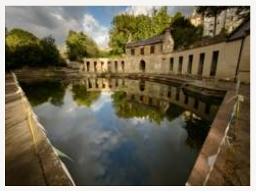
Cleveland Pools today

Cleveland Pools are superb early 19<sup>th</sup> century Grade II* listed public swimming baths situated just to the north east of Bath city centre adjacent to the River Avon (from which the original water supply was derived). Dating from 1815, Cleveland Pools is in fact the country's earliest surviving example of a Georgian public outdoor swimming pool or 'lido'.