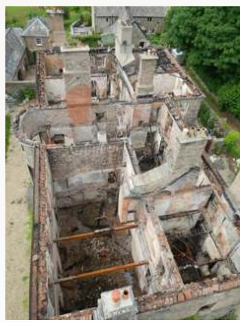
The gutted shell of Newland House following the disastrous fire of 16-17 April 2012; the surviving fabric was fully recorded by BaRAS (Bristol and Region Archaeological Services) prior to demolition