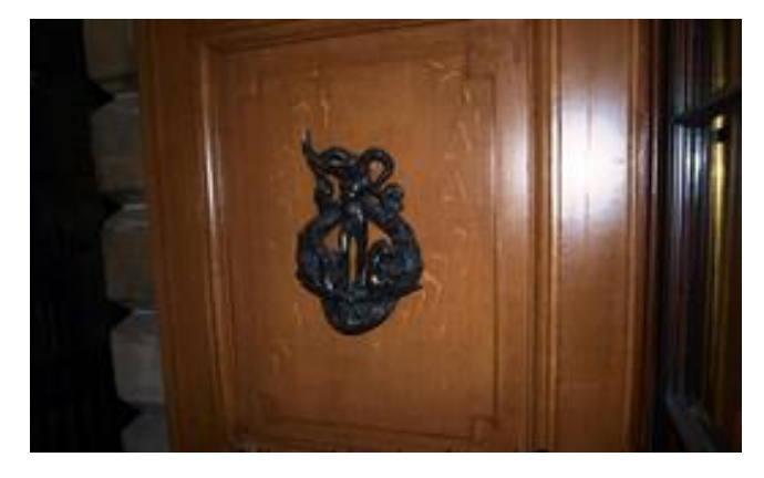
Door knockers to the front of Liverpool Town Hall

The Town Hall also includes a wonderful war memorial forming an entire room at the centre of the building. This includes decorative friezes above the rolls of honour. On leaving the building, it was remarked by one of the members that the front doors boast what must surely be the best pair of knockers in the North West!