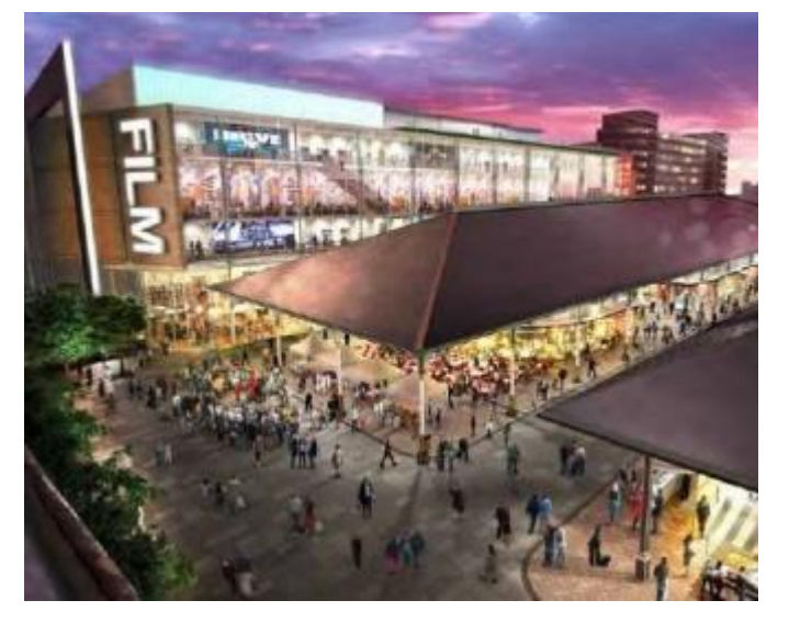
CGI of the Market Quarter in Preston

The global IBI Group have won the contract to take the Market Quarter project forward to strengthen and extend the appeal of the current market offer, create a landmark destination for the city centre and connect the Market Quarter more effectively to the surrounding areas. It is envisaged the Market Canopy to be lively and active into the evening time.