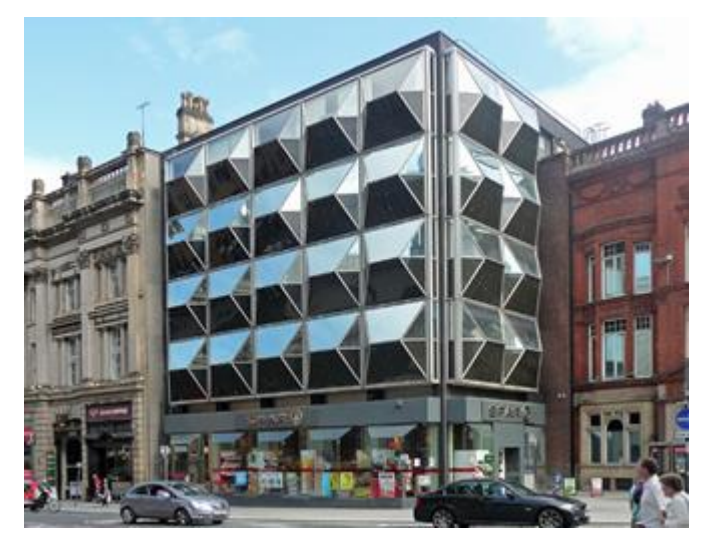
Midland Bank, Dale Street, Liverpool - grade II listed

The deregulation introduced to the planning system by the Enterprise and Regulatory Reform Act (ERRA) in 2013 is pertinent to this type of building. With modern offices, the special interest is often concentrated in certain parts of the building: it might be just the lobby, boardroom and façade, that are of special interest, and so it can be clearly set out in the List description which parts of the building are not of interest and can therefore be changed without consent (potentially open office floors, underground car parks etc).