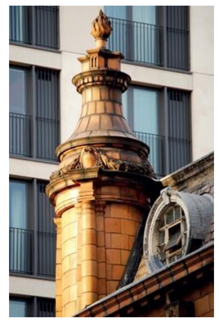
Terracotta finial to the corner of the London Road Fire Station in Manchester