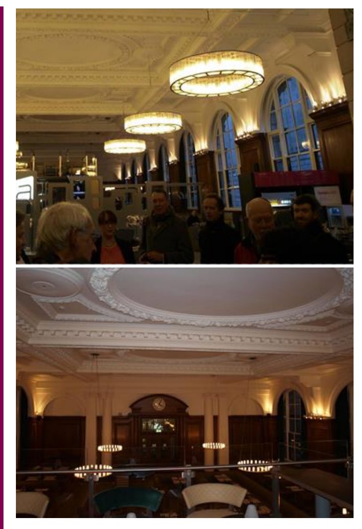
Dining room within the building and the views of the deco-

Chris Griffiths discussed the background and history of the building and explained how a 'pod' has been inserted into the principal dining area. This new addition now allows for detailed views of the decorative plaster ceiling. Furthermore, the spectacular circular atrium of the staircase within the building has been retained, amongst many other features.