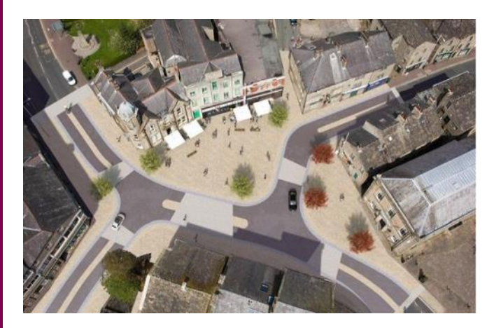
Plans for St James Square as part of the Bacup THI

St. James Square, Bacup will see a dramatic overhaul increasing pedestrian space and incorporating a more sympathetic palette of materials enhancing the conservation area's strong sense of legibility. To support the scheme a wide ranging series of educational events including subjects such as heritage crime, stone conservation and researching a buildings history can be found at www.bacupthi.org.uk