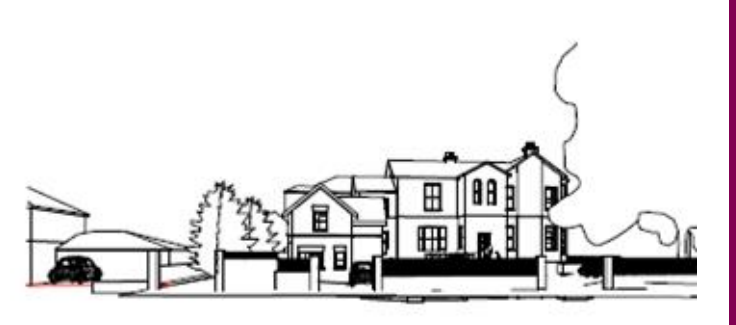
Proposed dwelling at No 2-6 Grange Park Road, Cheadle

Planning Permission had been granted for conversion of part of the building to flats with associated landscaping works, controlled by conditions. The application excluded part of the building plot, and an application was subsequently submitted for a new dwelling on this parcel of land, between the house and the road.