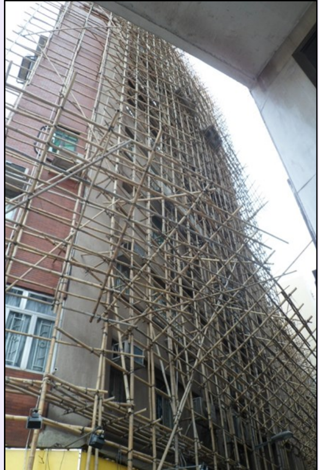
Hong Kong Phooey? Or just good old sustainability....it really is all bamboo.