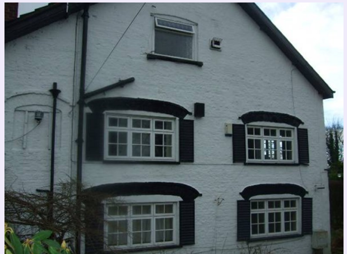
Some of the windows which the LPA considered as being ' not inappropriate ' and sought to retain.

The Inspector concluded that because of 'the particular and unusual circumstances', the proposal, 'would not be harmful to the character of the listed building' and, 'the benefits of double glazing would outweigh any visual impact which might arise from its use'.