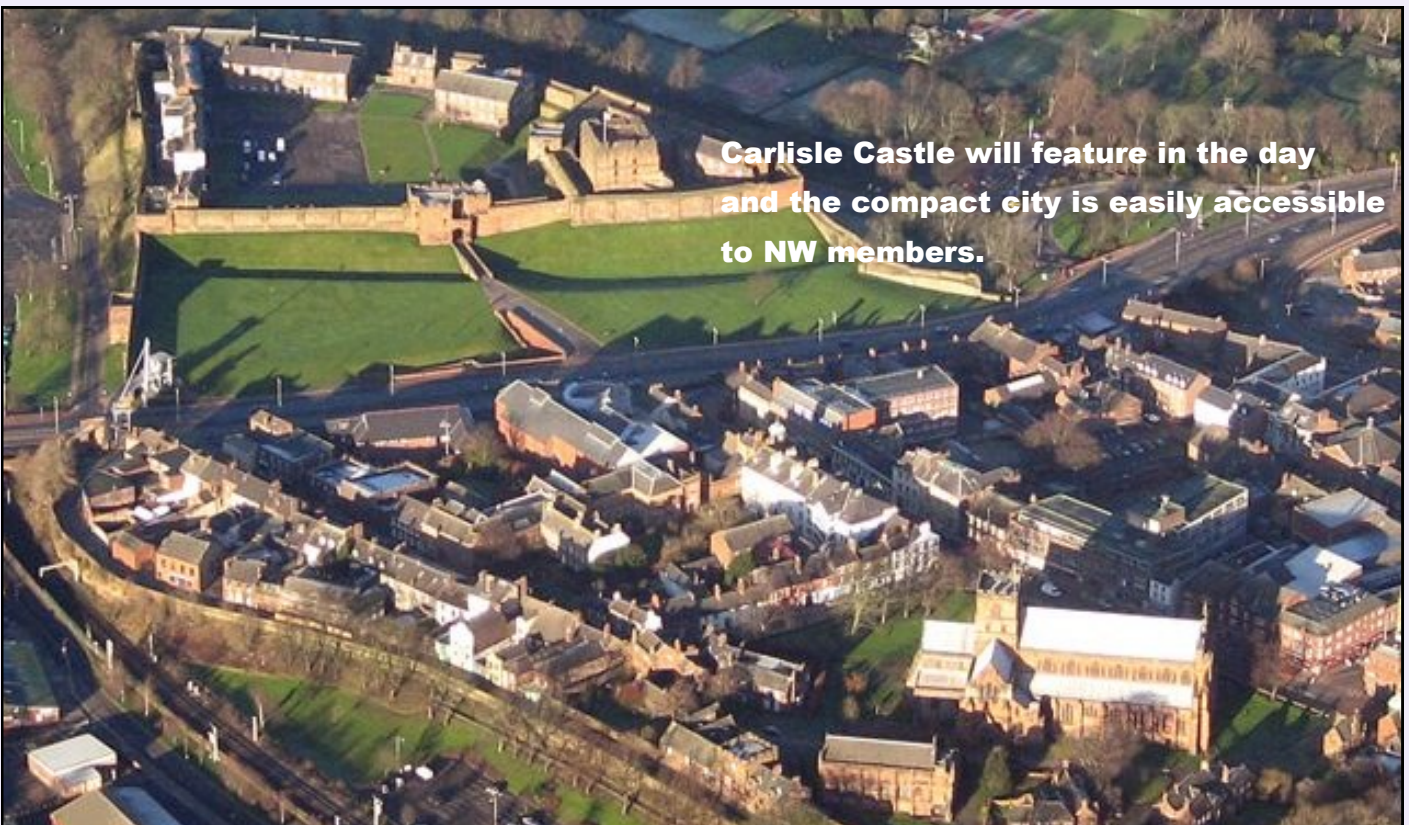
Carlisle Castle will feature in the day and the compact city is easily accessible to NW members.

Deadline for entries is Friday 12th April 2013. Successful applicants will be notified after Friday 19th April 2013 at the latest. The Committee's decision is final.