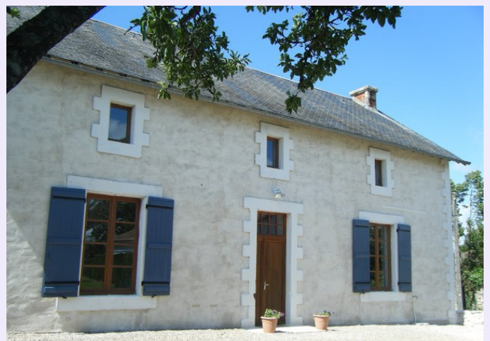
After ... C'est fini.