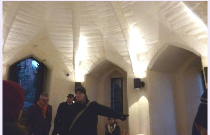
Ambiance being enjoyed in the Water Tower.

Additional works have included: repointing (removing extremely hard cement mortar), stone repair, and refurbishment of the leaded lights to the upper chamber.