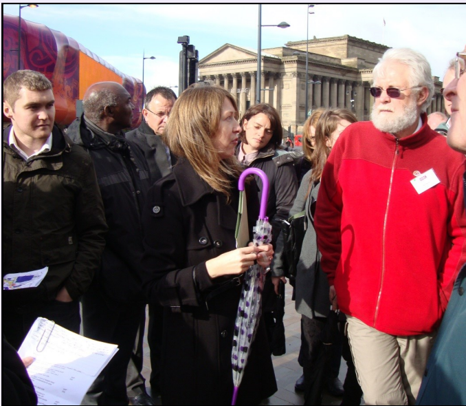
Branch conferences tend to be just before Christmas.

The number of sole practitioners in the private heritage sector is rising. Last year, 43% of IHBC members were in local or central government and 38% of IHBC worked in the private sector, and this year the balance may shift more towards the private sector.