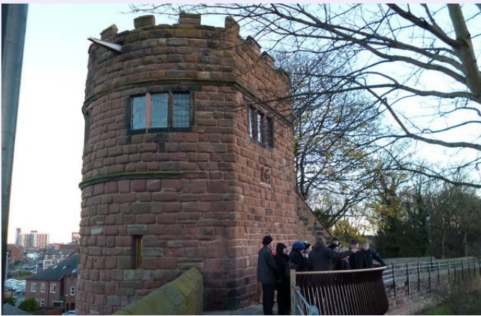
King Charles Tower first stop on the tour.

Those members partial to a pre-prandial ramble, assembled on the afternoon of the AGM and Christmas Dinner to stroll around the City Walls to view the works which have benefited from EU funding through the PORTICO Project . This a collaborative initiative between the cities of: Chester, Gent, Koln and Utrecht and the Initiatief Domplein Foundation in Utrecht. It aims to develop new methods, techniques and ways of conserving and interpreting the historic environment above and below ground.