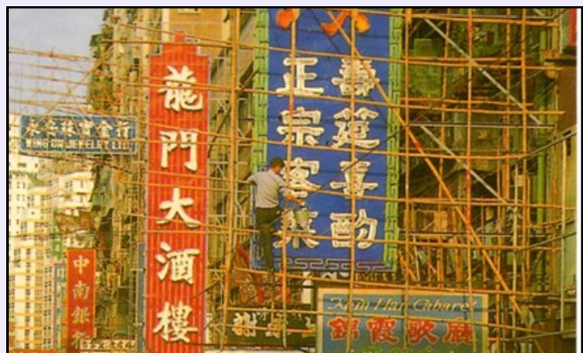
Hong Kong street advert (and man!). The sign is understood to read, "All visitors to site, must report to reception. No PPI, No Job!"