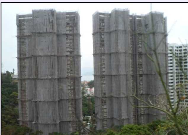
Hong Kong again , 2013 – and it is all bamboo behind the net screening – just how high can it be taken?