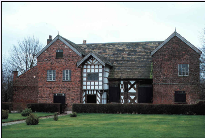
Baguley Hall, Wythenshawe... No, really!

To start the afternoon we shall visit Baguley Hall (Grade 1 & Scheduled Ancient Monument) located in Wythenshawe in the south of the City of Manchester.