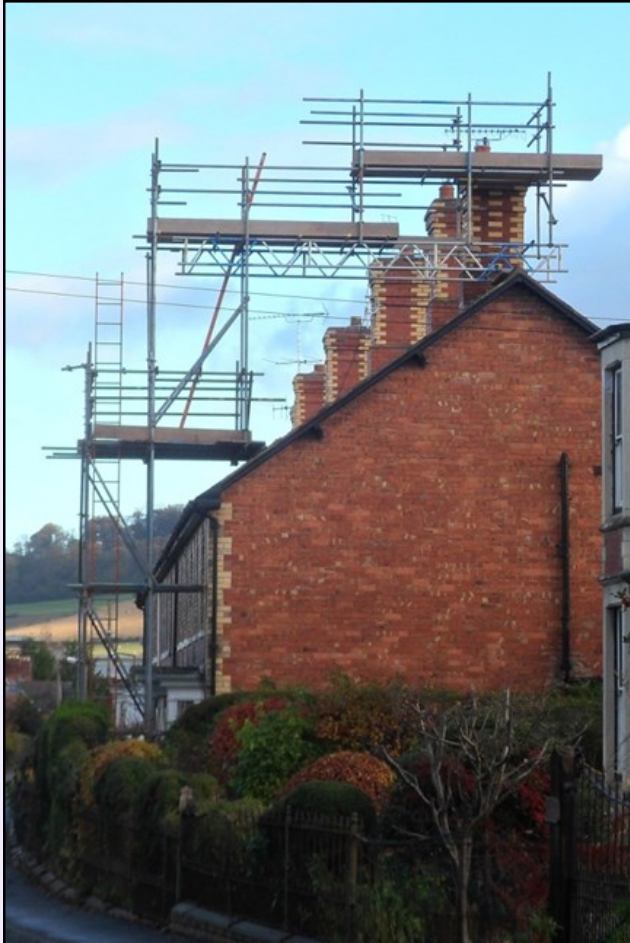
Proper British disregard for common sense, seen near Ludlow (November 2012)

Our roving ace reporter, looks at the crazy world of bolting tubes together in order to undertake major building work at height. Sadly our plucky British chaps are outdone by those fiendishly reckless types in the far east.