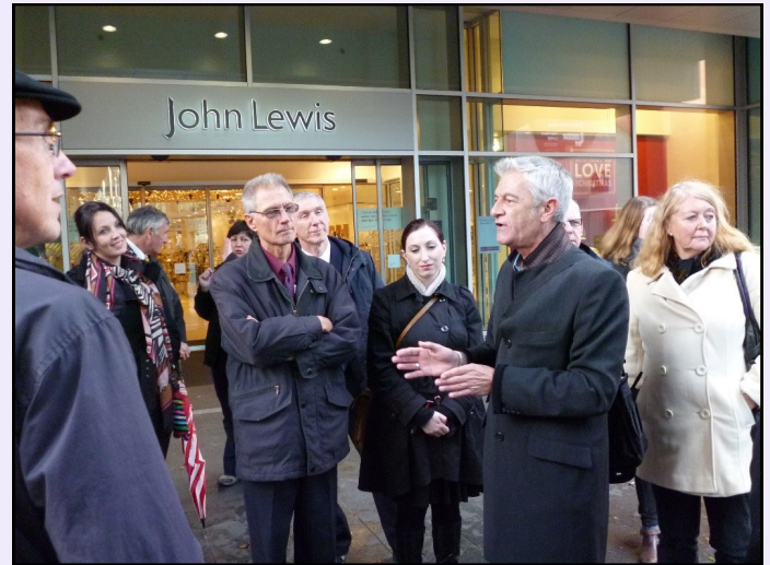
Branch conferences..... Never knowingly undersold .

one thinks that anymore (although some of the comments around last year's LBC consultation were a bit worrying !). We think the North West branch operates with a well-integrated mix of members from different sectors..